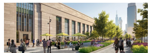
Market Street Plaza Expansion