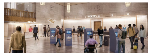
Tickets and Red Cap Pavilions