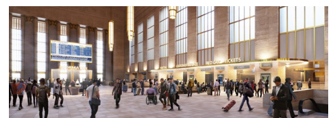
Main Concourse Signage and Information Pavilion