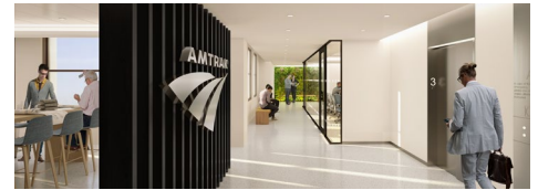
Corporate HQ Elevator Lobby